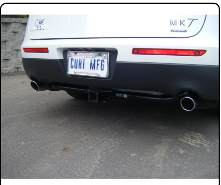
For more information log onto www.curtmfg.com, & for helpful towing tips log onto www.hitchinfo.com