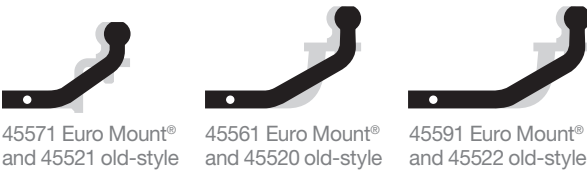
45571 Euro Mount® and 45521 old-style

The comparisons below illustrate each Euro Mount® replacing a common, old-style ball mount