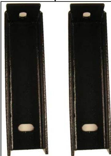
Passenger/Driver Rear Mounting Brackets