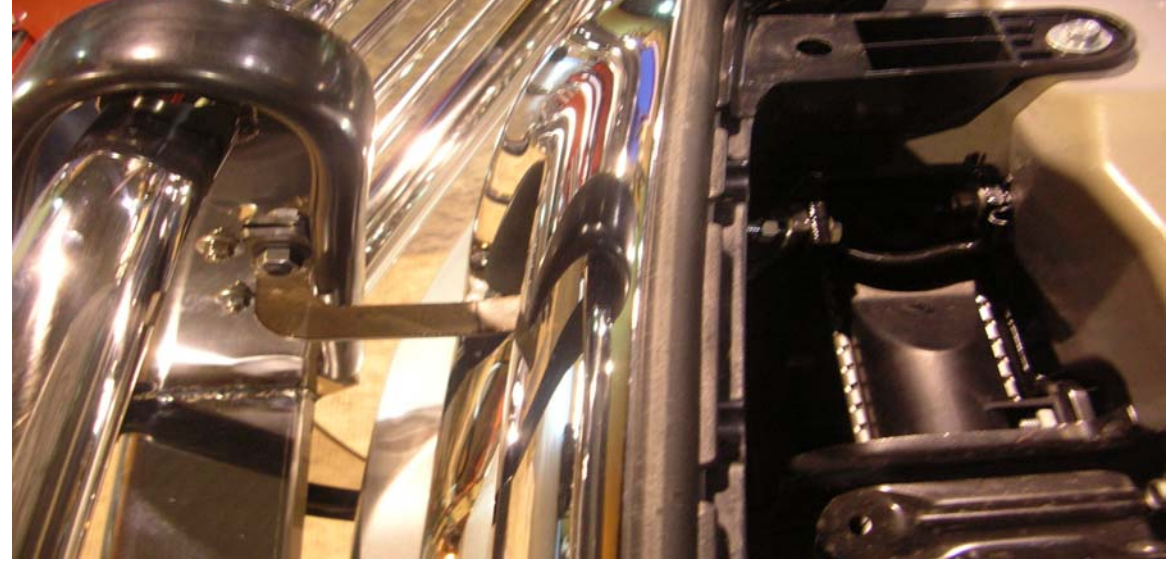
Diagram number 4. Brace bracket installed threw grill opening