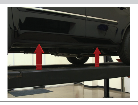
Driver side brackets

Starting on the driver side, locate the two mounting locations along the body.