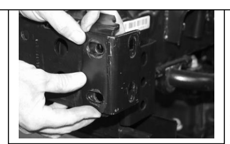
Page 1 of 1